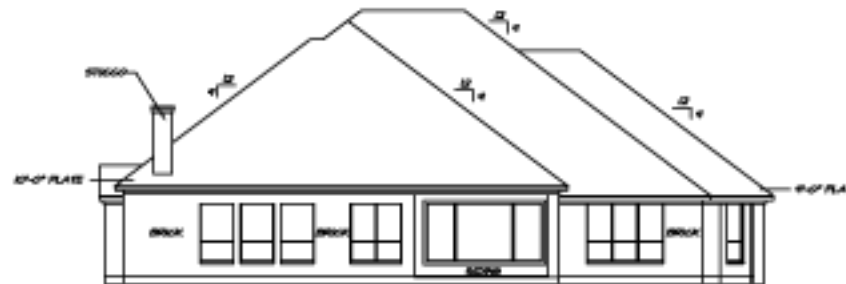
REAR ELEVATION SC 1/8" = 1'-0"