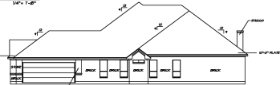
LEFT ELEVATION SC 1/8" = 1'-0"