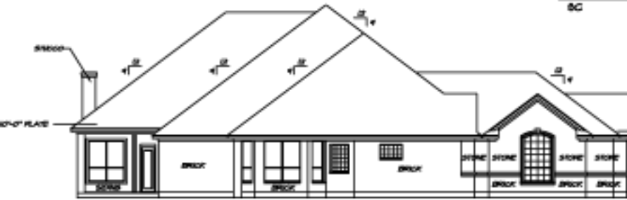
RIGHT ELEVATION SC 1/8" = 1'-0"